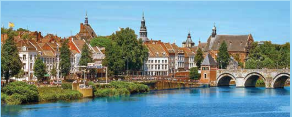
Photo below: Look out onto the storied River Meuse from the picturesque town of Maastricht.

Cover photo: Cruise through the Netherlands, where tulip blooms announce the arrival of spring.