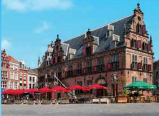
Discover the Netherlands' oldest city, Nijmegen, with its historic De Waagh, still a central gathering place.

CULTURAL ENRICHMENT: On an expert-guided tour of the museum, see works by quintessential artists such as Picasso, Monet, Renoir and Manet, as well as captivating late 19 th - to 21 st -century pieces by Rodin, Moore and Dubuffet, wreathed in the idyllic woodland scenery of the 60-acre sculpture garden.