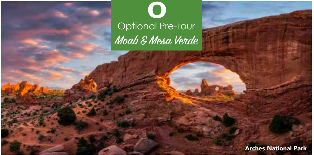
Arches National Park

Take advantage of extra days in the Southwest to admire its dramatic desert landscape, colorful culture, and relaxing leisure activities. Enjoy guided touring at three additional national parks, returning to impressive park lodges at the end of each exciting day.