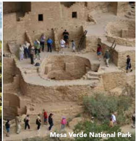
Mesa Verde National Park